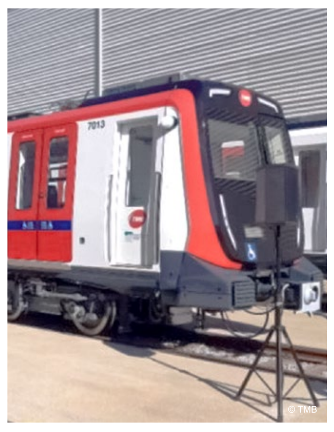
Sustainability was the top priority in the acquisition of the vehicles.

by its highly energy-efficient trains. The Metropolis platform that is used for the Barcelona project is considered a signature project.