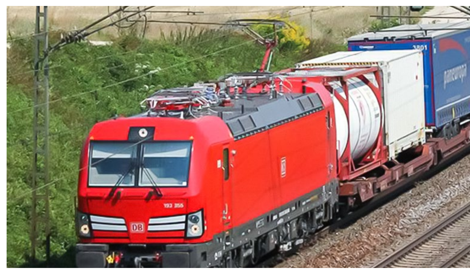
The master plan for rail freight transport aims at strengthening the shipping sector.

Climate change and environmental degradation are existential threats to Europe and the world. The European Commission has presented the European Green Deal, a concept for the reduction of greenhouse gases to zero in order to become the first climate-neutral continent. Sustainable mobility is a major component. In order to reach this goal, traffic must shift from roads to railways. This is true in particular of rail freight transport.