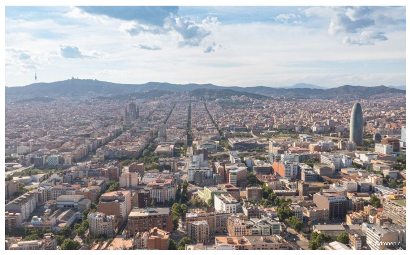
TMB ordered 50 vehicles on the Metropolis platform fitted with the SMARTconverter 3 for metro lines 1 and 3.

The Catalonian capital of Barcelona offers so many fascinating attractions to visitors that one can easily overlook the fact that this city is also on its way into the 'Champions League' of several sustainability rankings. This is reflected in the latest generation of rolling stock for the Barcelona metro system. Alstom started supplying the units this year – and put our SMARTconverter 3 on board.