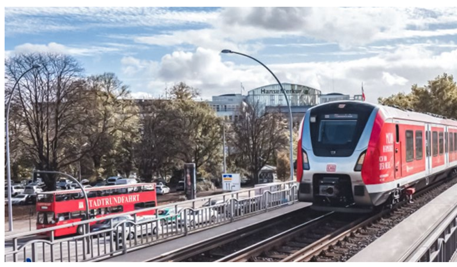
New Hamburg suburban railway vehicles such as the ET490 EMUs are dual-system vehicles.

In 2025 and 2026, the suburban railway in Hamburg will add a total of 61 new electric Alstom ET490 multiple-unit trains to its fleet. The vehicles will be factory-fitted with the European Train Control System (ETCS) and prepared for automated operation. Also on board: Dinghan SMART water-cooled auxiliary power converters and battery chargers.