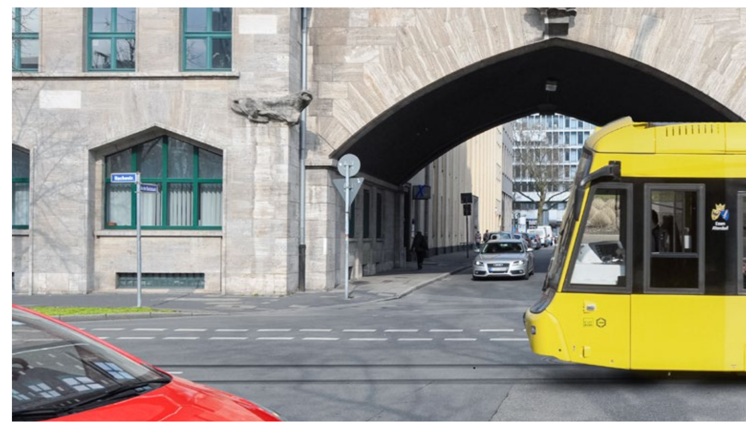
Taking the SMARTconverter LIGHT on board in 2023: new light-rail vehicles of Ruhrbahn in Essen.

The SMARTconverter LIGHT concept is proving its worth. The goal of creating a unit with low energy consumption and low costs for operation and maintenance resulted in the development of an efficient, quiet and low-maintenance auxiliary power converter for trams. But that's not all: the high efficiency of the auxiliary power converter increases the sustainability of the vehicles in operation. And this is a requirement that is becoming more and more important for urban and suburban public transport.